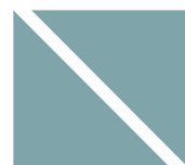
60 half-square triangles